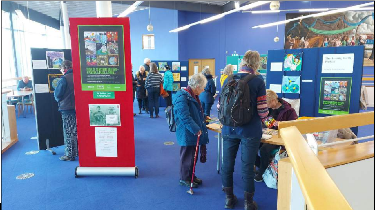
A group of local Quakers explore the Loving Earth exhibition at Bournemouth Central Library

The underlying aim of this project was to help people engage more deeply with the environmental crisis, and to take actions inspired by love and without being overwhelmed. The Steering Group wanted to try and gain some indication of whether this had