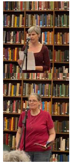
Poetry reading in the Library at Friends House to launch the publication of "Out of Excuses" poetry book.