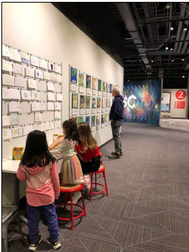
Loving Earth exhibition at the Museum of science and Curiosity in Sacramento, California

In general, people found the project encouraging, validating, and they came away with a stronger commitment to action on environmental issues. The combination of art/craft and texts or conversations about the substantial issues was particularly appreciated, engaging people at different levels. Using beauty and imagination helped make it more enjoyable for people to explore some challenging issues and encouraged them to do so.