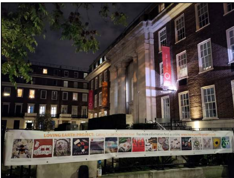
Loving Earth Project banner created by Friends in Northumbria advertises the exhibition at Friends House.

The Steering Group decided to review the impact of the project in terms of its overall aim, which had been to help people engage more deeply with the environmental crisis without being overwhelmed. Early indications have been positive, and that the combination of imagination, beauty, practical craft work and discussion have helped most people in this respect. It has been pleasing to notice that the project has been helpful in addressing climate anxiety, including for children, by helping them understand the issues a little better, and to find actions they can take to help.