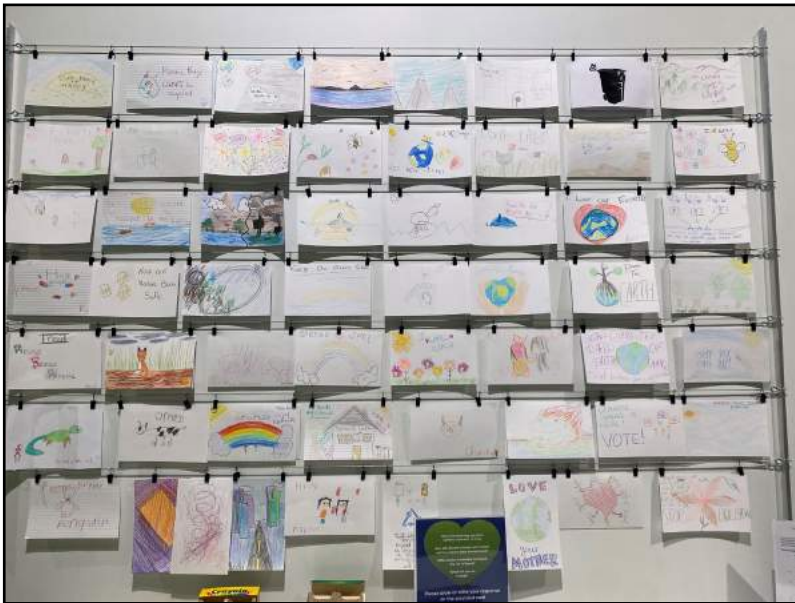
Part of a wall of responses on postcards made by visitors to a Loving Earth exhibition. Over 2000 such postcards have been printed

A group of 50 panels has also been loaned to the Protestant church in France (Eglise Protestante Unifiée de France) for two years, and they plan to develop their own French language materials for the project, including for children, and to hold exhibitions and events around France.