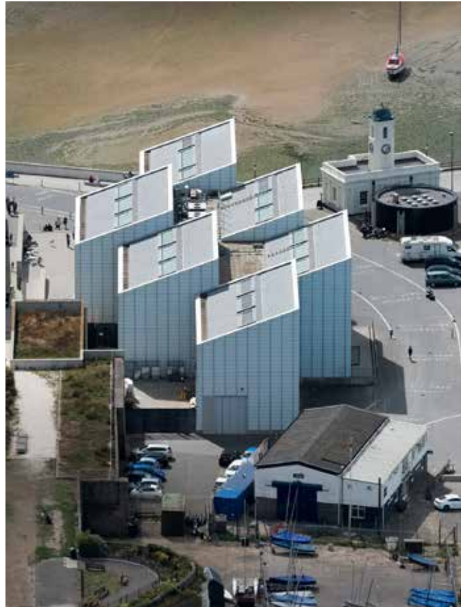
The Turner Contemporary, Margate.