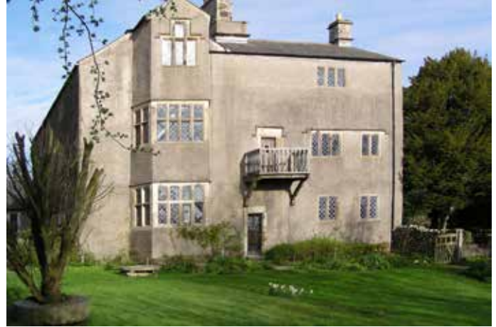
Swarthmoor Hall.

weeks, with a spring closing date. Please watch this space, and meanwhile, start thinking creatively about the challenges of living sustainably on this planet, and how our Quaker faith and practices can help.